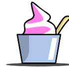
g. I _ _ c _ e _ m